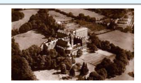
Manor House UK for (Birth Place of Mill Hill Missionaries 1866