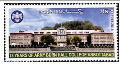
(Postage stamp issued in 2018 on Diamond Jubilee Celebration)