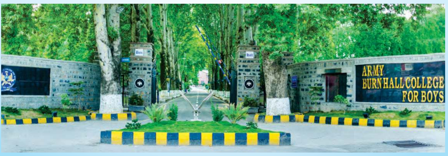
A gateway to knowledge, style and culture!