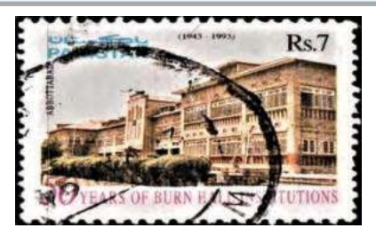
(Postage stamp issued in 1993 on Golden Jubilee Celebration)